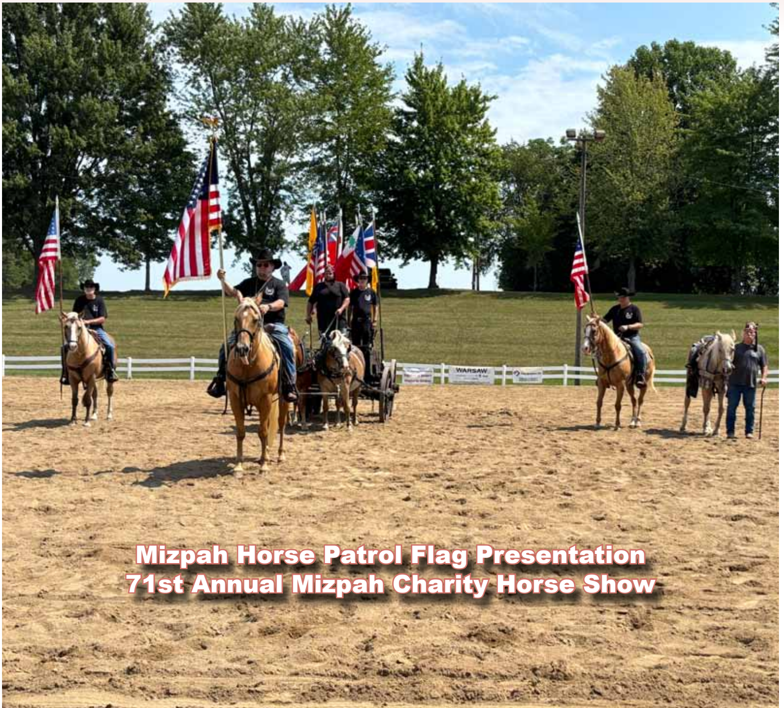
Mizpah Horse Patrol Flag Presentation 71st Annual Mizpah Charity Horse Show