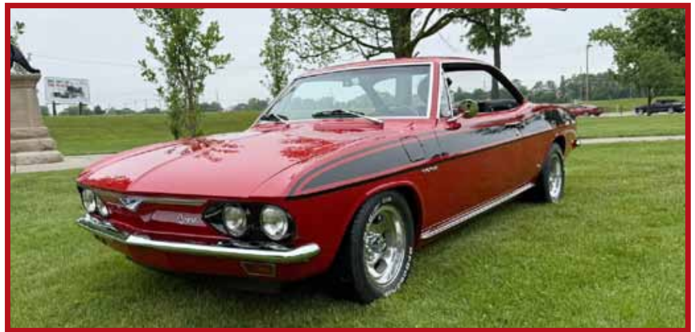
2025 Best in Show