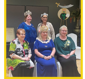
Reigning Queens with Supreme Queen and Past Supreme Queen