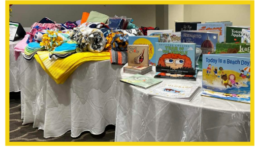
A display of the most recent work and purchases that Lakeshore Nile Club has completed for the hospitals