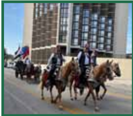
Horse Patrol at GLSA

Next, I want to thank everyone that was able to make it to GLSA in Bloomington, IL. I had the pleasure of meeting Mizpah's Horse Patrol at a restaurant for the GLSA Horse Patrol Annual Meeting. It was an honor to install their officers for the next year. Just after the installation, a young man came up and asked if we were Shriner's, I said we sure are. He was the patient ambassador for the Chicago hospital for the Golf Tournament in Las Vegas last year. He has made it through his Entered Apprentice Degree and wants to become a Shriner once he is through his Master Mason Degree. The next day was the GLSA parade, which I was so proud to see 5 of the Antique Power bring their tractors and 5 of the Horse Patrol bring their horses, the hitch and team, and the pooper scooper.