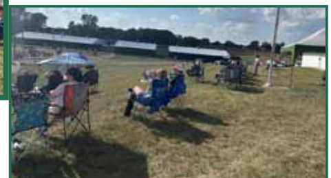
Pictures from Buckle Bash